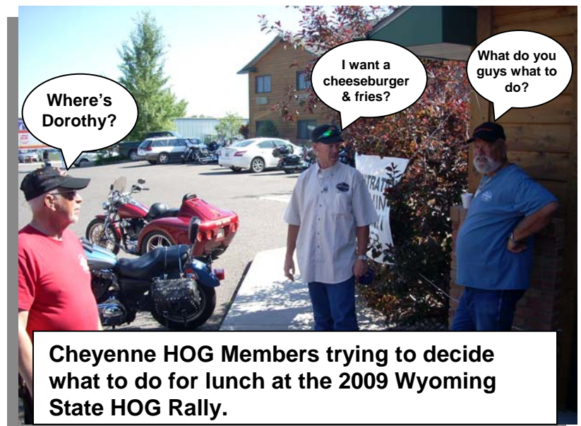
Cheyenne HOG Members trying to decide what to do for lunch at the 2009 Wyoming State HOG Rally.

Old Business: The Chapter Christmas Party will be held on Saturday, December 19 th at the Historic Plains Hotel in Downtown Cheyenne. The menu for this year's party looks fantastic. Baked salmon, Italian Chicken, and savory roast beef, along with multiple salads, choice of potato and decadent desserts will be offered. The plan is for a buffet set-up just like we had last year. Plan on limiting-out so you can try at least one of everything on the menu because the food is always excellent at the Plains. Prices this year will be as follows: If you have three filled punch cards – your supper is free courtesy of the Chapter and Mavericks.