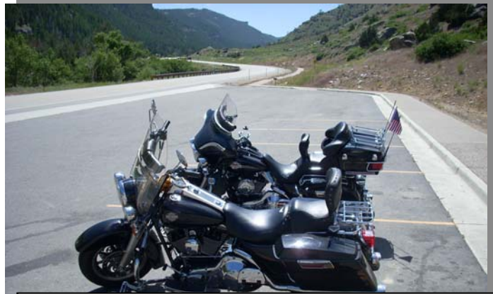
Two seriously good looking bikes at the Popo Agie Rise in Sinks Canyon.

Two filled up punch cards – your meal is $12.50. Less than two filled out punch cards – the price is $25.00. Guests will also be $25.00. There will be a cash bar and a dance floor. Turn in your punch cards (if you haven't already done so) and/ or purchase your tickets at the door. We will also be doing a gift exchange at the party just like last year. Women bring a wrapped gift for another gal, and men bring a wrapped gift for another guy. Gift cards are also totally acceptable. Dollar limit on gifts is $25.00 MAXIMUM – even though some jokers in our midst tried to say $25.00 was the minimum. Please do not spend more than $25.00 on the gifts.