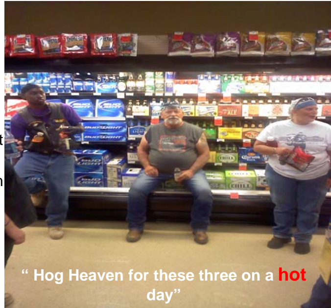
“ Hog Heaven for these three on a hot day”

The mileage challenge is over on 30 Sept. Please have your mileage turn in at the next meeting. It also includes you passenger as well. If you will not be attending the meeting, please send it to me at dbrdist@aol.com or 635-8300. You can also reach Scott at skootrhd@bresnan.net or 634-0115. It is important that we receive everyone mileage, as Thornton Chapter is very strong.