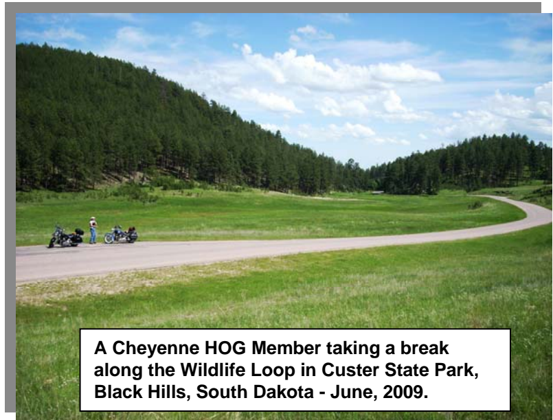
A Cheyenne HOG Member taking a break along the Wildlife Loop in Custer State Park, Black Hills, South Dakota - June, 2009.

The Mileage Challenge we have going with the Thornton HOGsters ENDS SEPTEMBER 30 th . On October 1 st , you need to record the mileage on your bike and bring it to the October Meeting. We will add up all the miles to see if we spanked the CCT HOGsters. A barbeque for all three Chapters (Thornton, Laramie and Cheyenne) will be held where the traveling trophy will be handed to the winning Chapter. Barbeque date TBD.